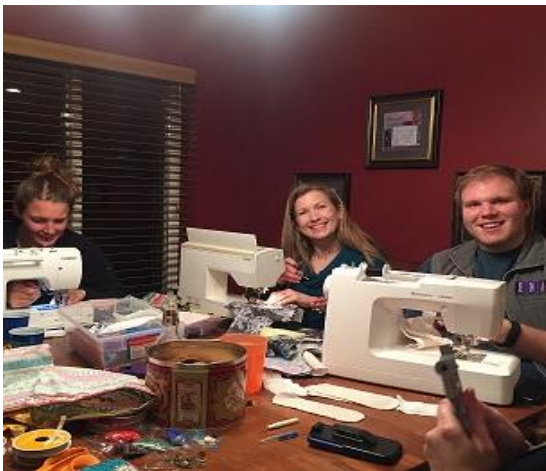
2016 Sewing bee underway!